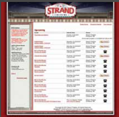
Branding Opportunities with Ticketing Site