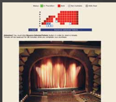
Show Patrons the view from their seat